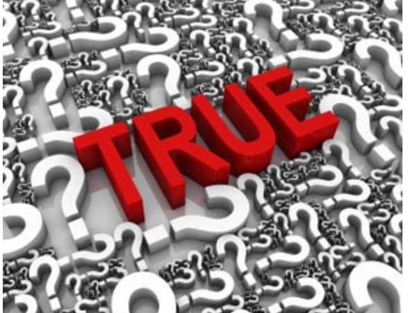
"Within about 90 minutes," according to CBS News, "the state homeland security and emergency management offices posted on Twitter that no emergency existed, but by then people had called a variety of local, county, and state agencies to express their concerns."

For additional information on: The CBS News report, visit http://www.cbsnews.com/8301-201 162-57341882/mistaken-verizon-emergency-alert-scares-n.j/