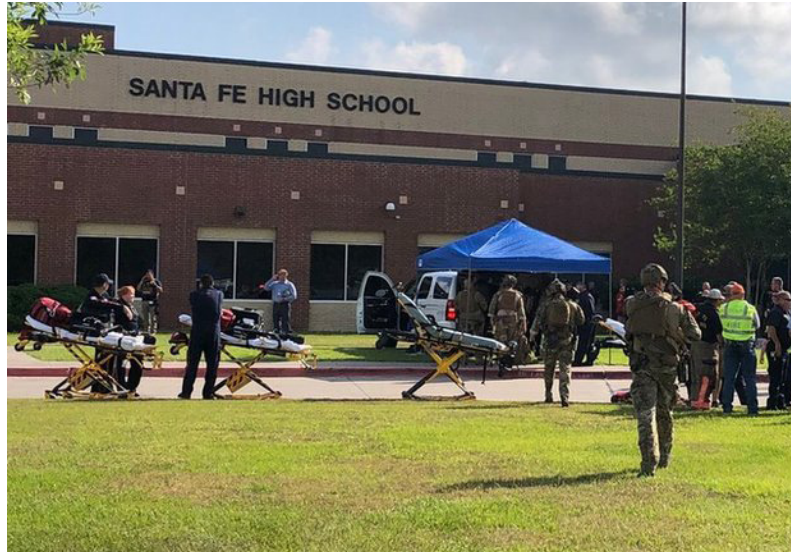
Shooting at Santa Fe High School in Santa Fe, Texas, 18 May 2018.

The key components of the parent/student reunification plan should include at the minimum: